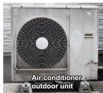
Air conditioner outdoor unit