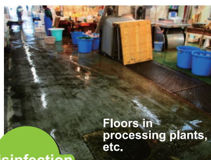
Floors in processing plants, etc.